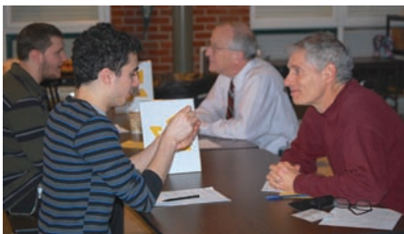
Volunteers help to prepare students for real-world job interviews

At BART, seniors must complete an 80-hour internship as a graduation requirement. In anticipation of this, human resources professionals and other members of the community came to the school on January 17th ready to help them prepare. Mock interviews were set up in the style and format