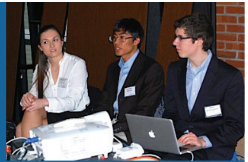
Williams app designers field questions during a presentation

Their proposed solution: an app that would do everything that BART wanted and was designed to make the laborious process of teacher evaluation and data-analysis sharing easier, enabling administrators and teachers to spend less time crunching numbers and more time improving instruction. Combining video capabilities, an observation matrix, and a qualitative feedback section, this